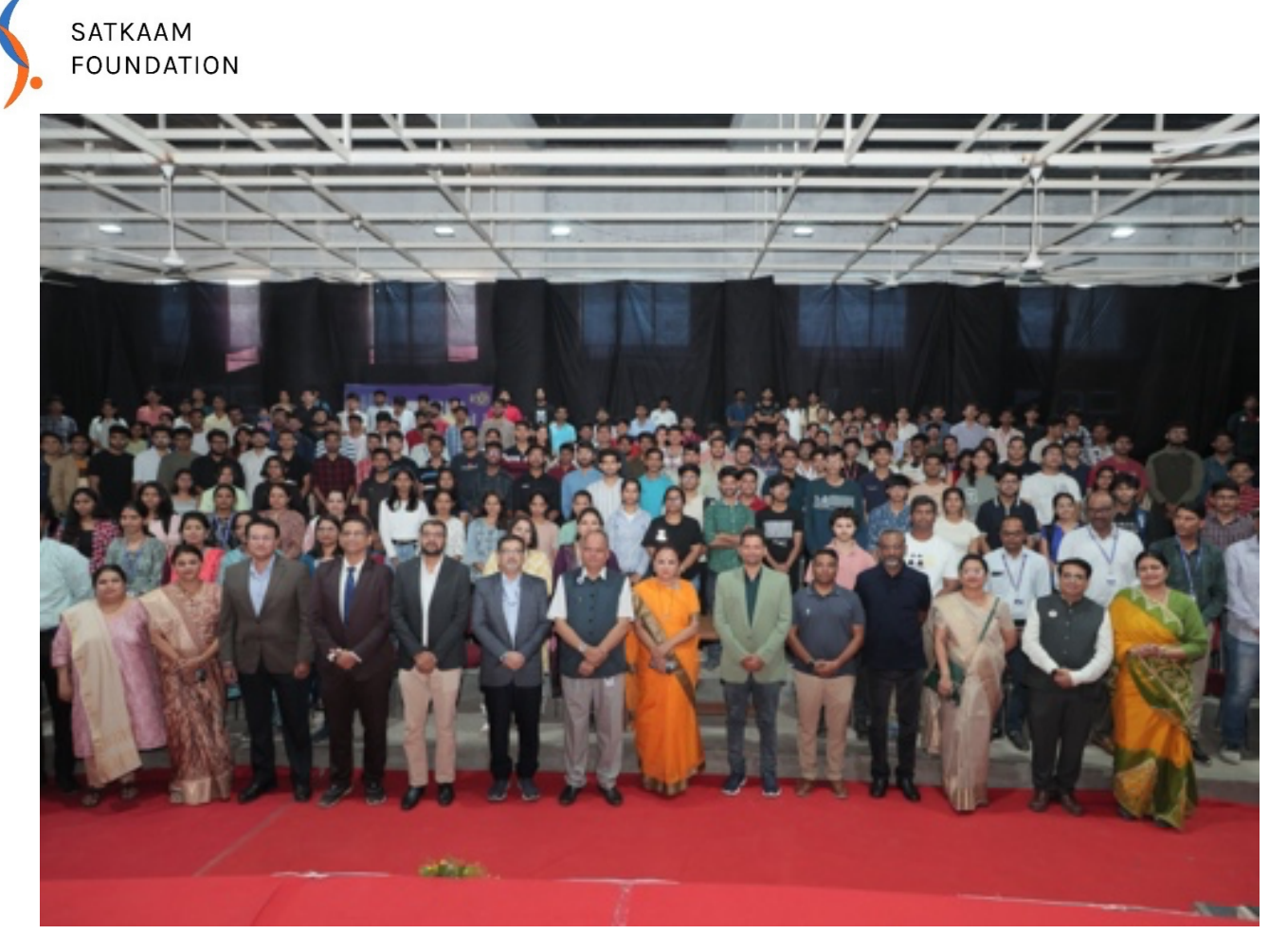
Satkaam Enterpreneurship Program

We are in the midst of launching this new program and looking for volunteer universities which would be interested in conducting these programs. The plan here is to conduct these in a contiguous 3 day workshop fashion to help / guide / mentor students who plan to start a small business and looking for guidance from the industry. We have had initial discussions with a couple of universities and the plan is to conduct this in the break before the start of the next semester.